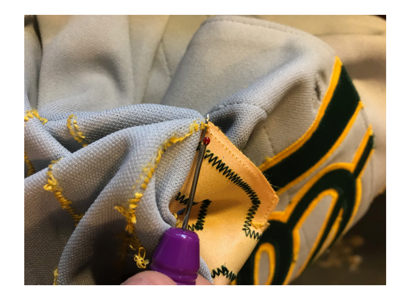
Showing the correct way; carefully ensuring that there is no jersey fabric pinched between the tool and the twill.

If the lettering won't come off, or comes off with difficulty, tearing or leaving behind massive glue and stains, it is best to stop and send me a photo. We can decide what to do. Rarely, but sometimes old lettering is so tightly adhered that its removal is ill advised unless we will be sewing the exact same thing over top. I will often advise you to rip the thread but let me try to get the lettering off.