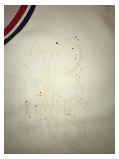
Lifting the corner of this Reds logo, I can already tell from ample experience that it is going to leave a red stain that will be very, very difficult to remove. At right is the result if having removed a minor league logo that had been sewn on this former Indians MLB jersey. A lot of scrubbing and use of a bleach pen faded it enough to make it less objectionable.

has been applied to it. This happens most frequently with red and yellow twill, and there is no guarantee that the staining will come off. I have several tried and true methods of cleaning these stains, and these are usually safe, but before I attempt this work you will need to agree that I am doing this at your own risk.