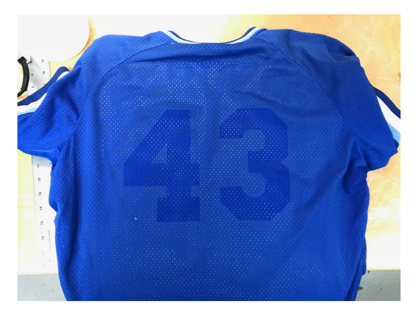
The player numbers leave distinct unfaded marks on this game worn mesg BP jersey. There is not much you can do about this except cover the spots with new numbers which will make this much less obvious.

The newest "tech" fabrics like Cool Base and Flex Base<sup>TM</sup> greatly dislike rough handling. If they are badly stained there may be no remedy except recovering the spots with the same lettering again. When this stuff starts to tear, it reminds me of wet toilet paper: it loses its structural integrity in a hurry.